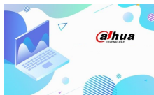
NIC-EVS71-10G OCH Nonstandard Network Card Module