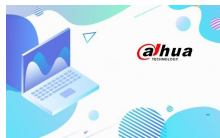
NIC-EVS71-10G OCH Nonstandard Network Card Module