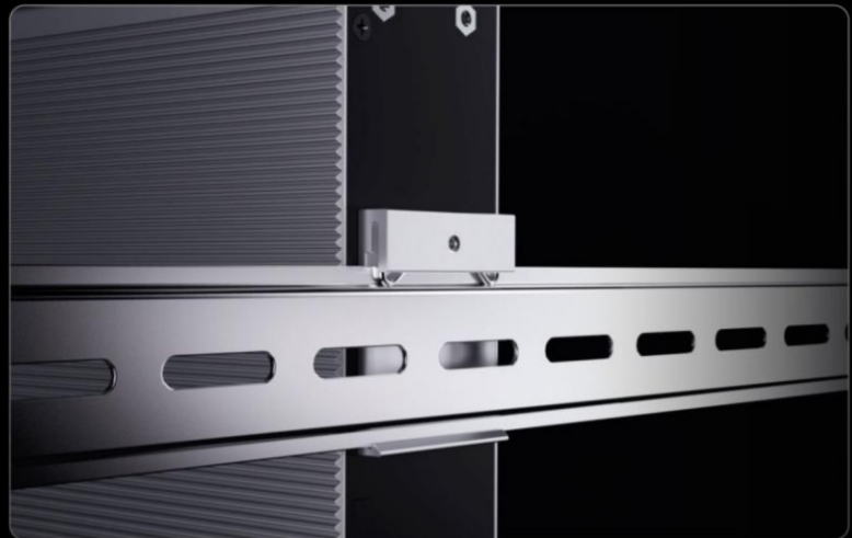
DIN rail mounting support for simplified installation