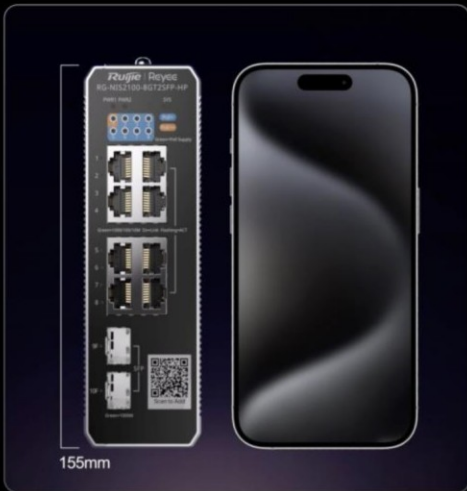
Compact design, perfectly fit into a waterproof outdoor box