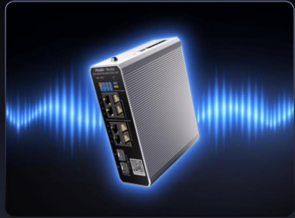
EMC Level 4 Against Electromagnetic Interference

90W PoE Output Perfect for High-Power Device