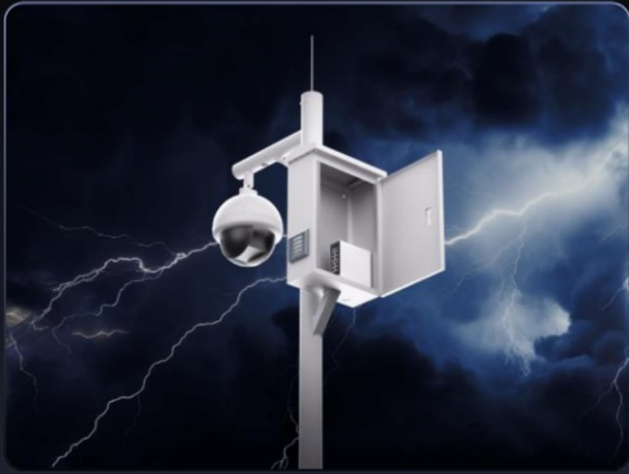
6kV Surge Protection Against Voltage Spikes